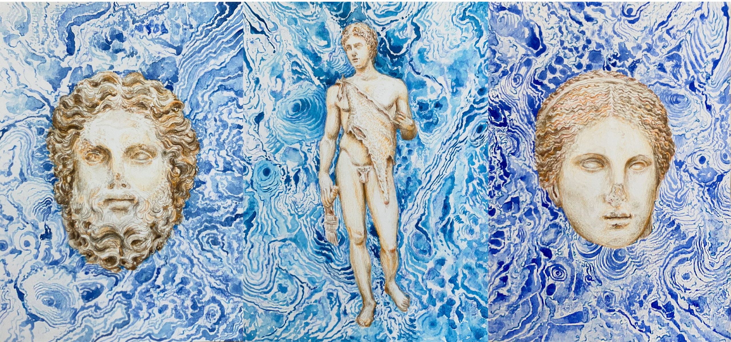
Philosopher, Pan, Venus. Glyptoteket, Copenhagen. Watercolour and coloured pencil on paper 21 x 15 cm each