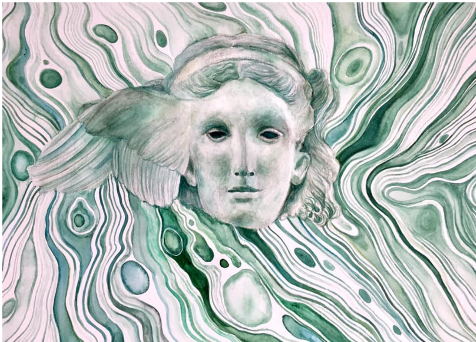
Psychhypnos , 2020 watercolour on paper 29,7 x 42 cm