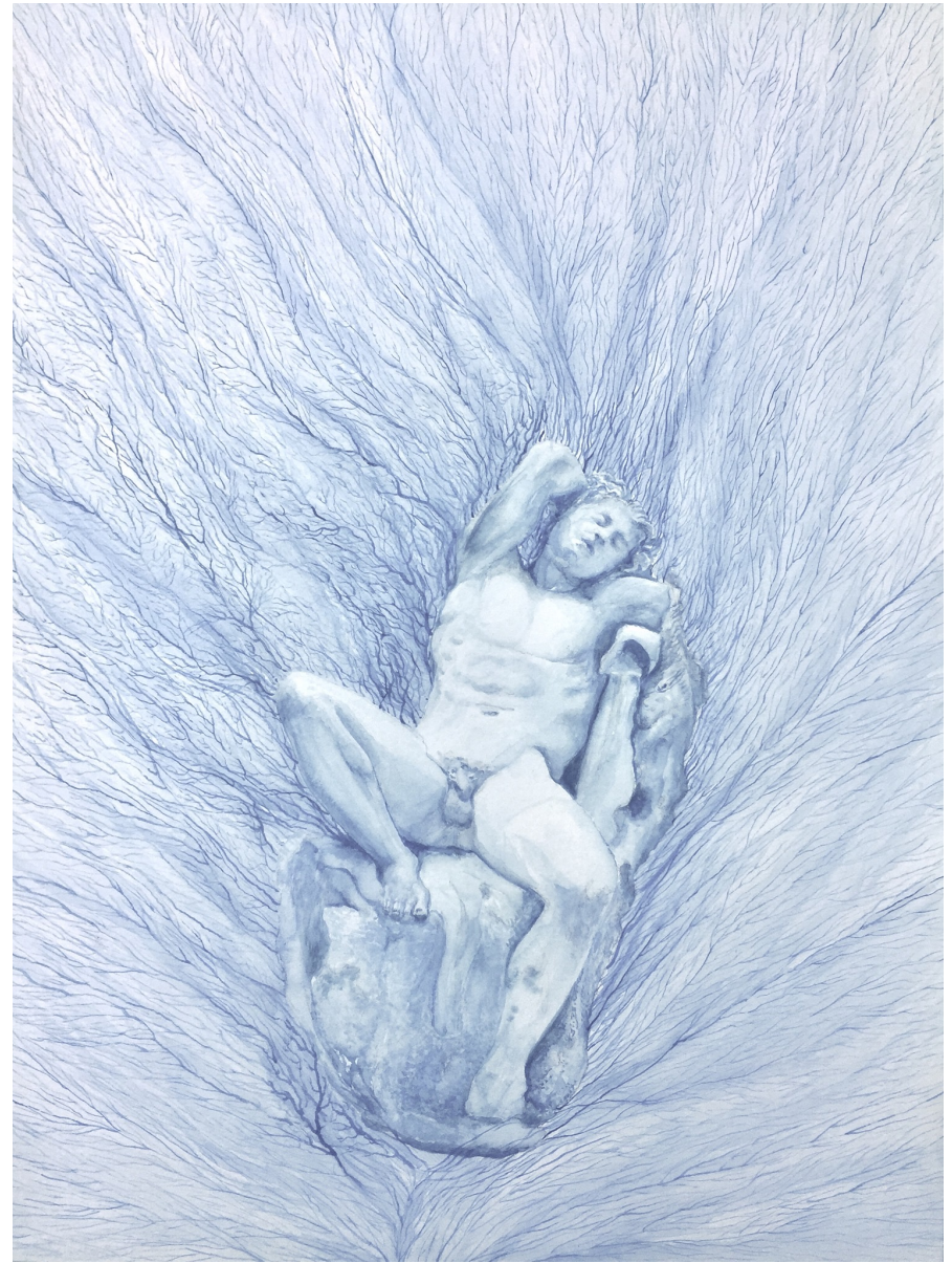
Sleeping Ariadne – Sleeping Faun Underwater coloured pencil and watercolour on paper 42 x 29,7 cm each