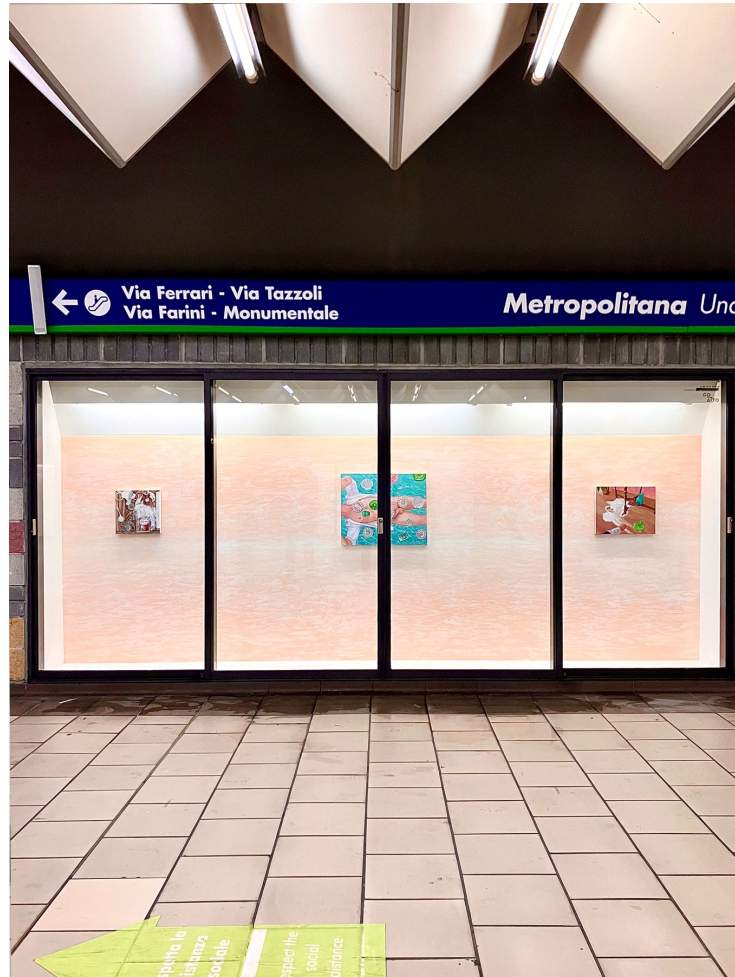
Tales of the Inside_out: Through the Mirror Installation view at Co_atto, Milan Site-specific acrylic wall painting, oil paintings 2022