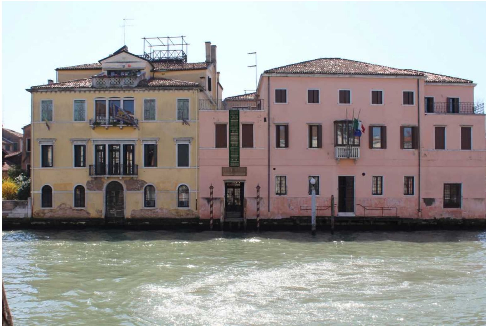
Venetian Windows #1 Laser-cut Tessiture Bevilacqua velvet 540 x 100 cm, 2019