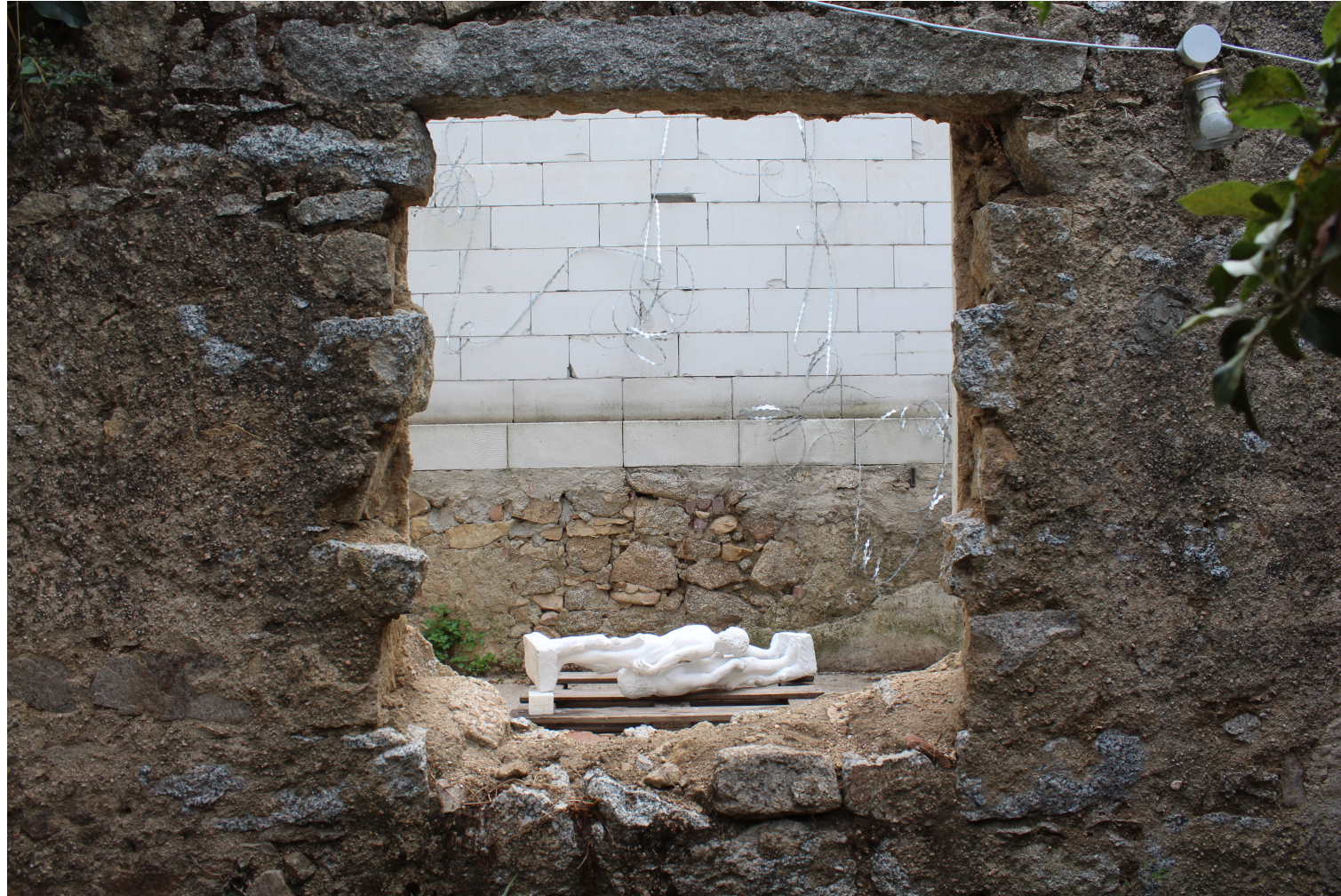
Foetus in foetu Concrete sculptures, sugar cubes Various dimensions 2018