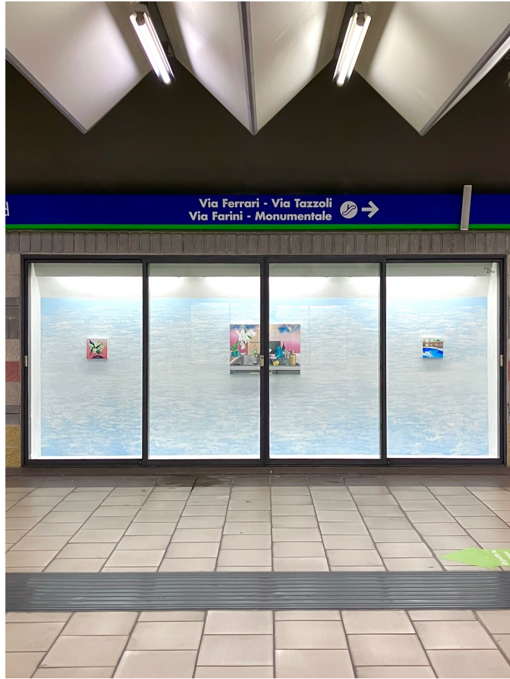
Tales of the Inside_out: Through the Mirror Installation view at Co_atto, Milan Site-specific acrylic wall painting, oil paintings 2022