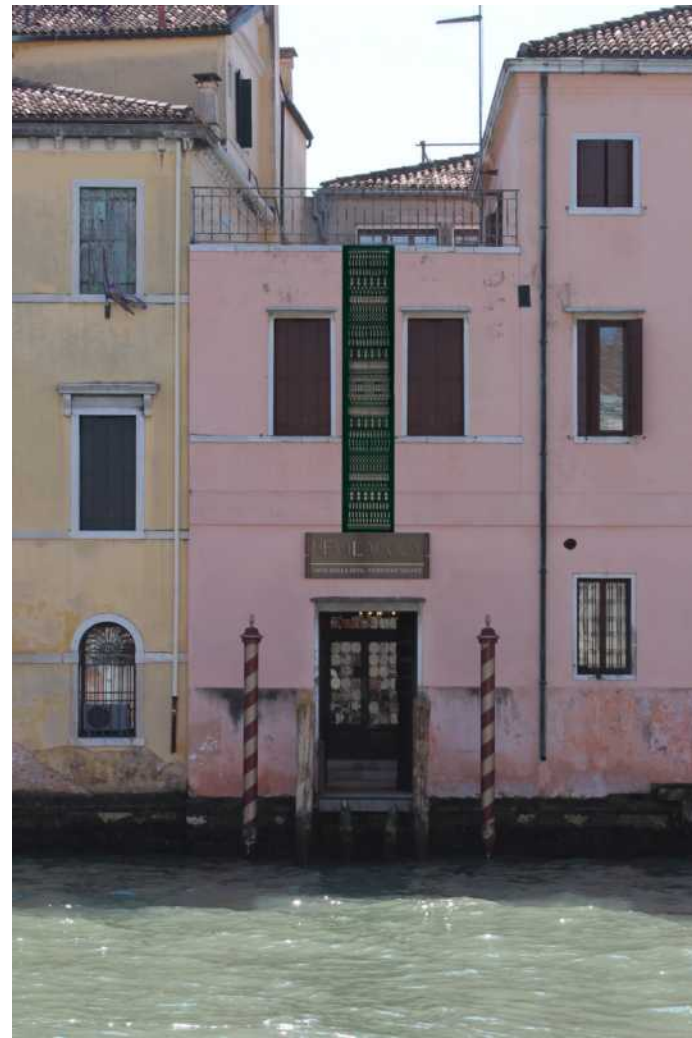
Venetian Windows #1 Laser-cut Tessiture Bevilacqua velvet 540 x 100 cm, 2019