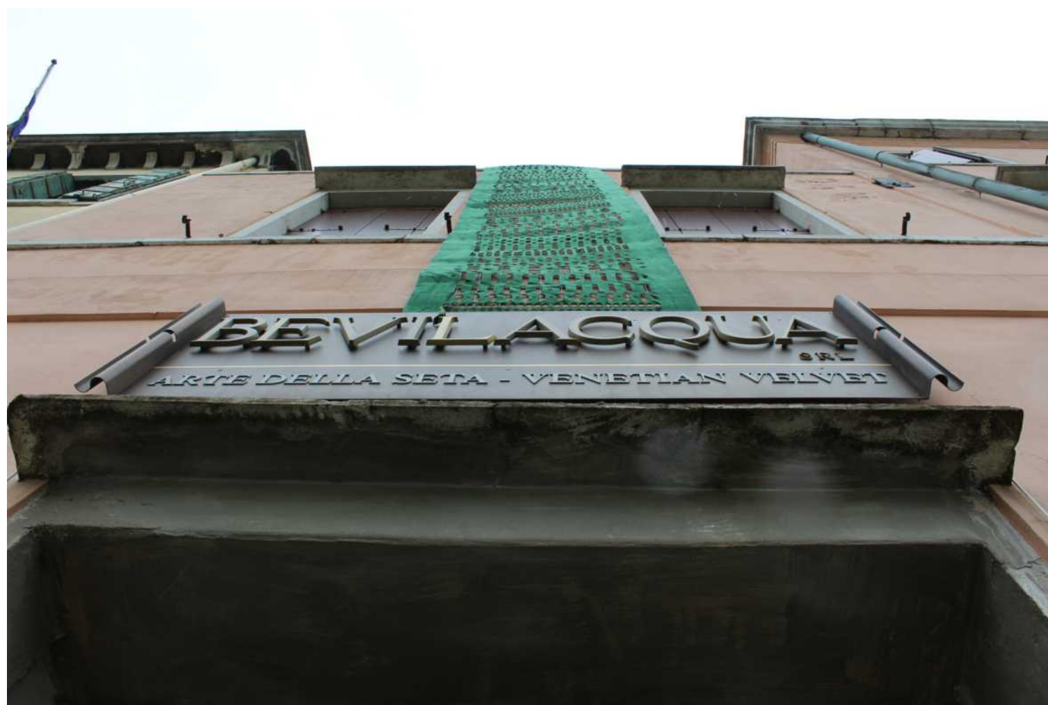
Venetian Windows #1 Laser-cut Tessiture Bevilacqua velvet 540 x 100 cm, 2019