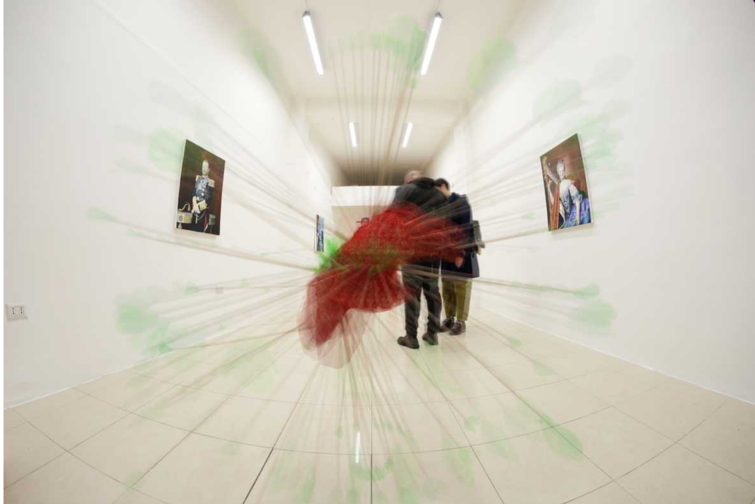
Bloody Cheque – Elio Ticca Installation view at Spazio E_EmmE, Cagliari, Italy. December 2019